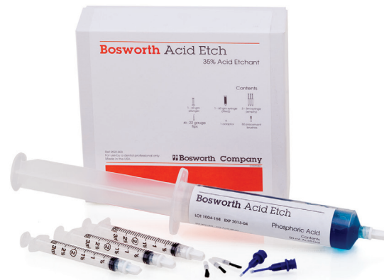
Jumbo Syringe Kit

Acid Etch® is 35% high viscosity phosphoric acid. Our Acid Etch® is silica and glycerin-free, providing a deeper etch pattern for easier application of bonding material. For increased patient comfort and easy clean-up, Acid Etch® is highly viscous, allowing for more accurate placement on enamel or dentin. Material will not slump, slide or run. Acid Etch® is clear aqua blue in color, odorless and tasteless. Allows flowability and clarity while providing complete coverage. Ideal for everyday restorative procedures within every office.