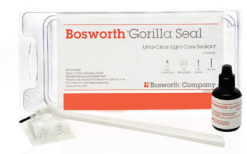
Standard Kit (syringe)