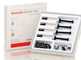
Standard Kit (bottle)