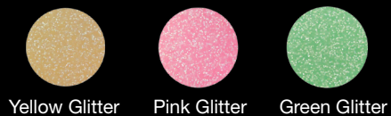
Yellow Glitter Pink Glitter Green Glitter