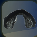
Generic Boil & Bite