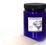
Diamond D Denture Acrylic