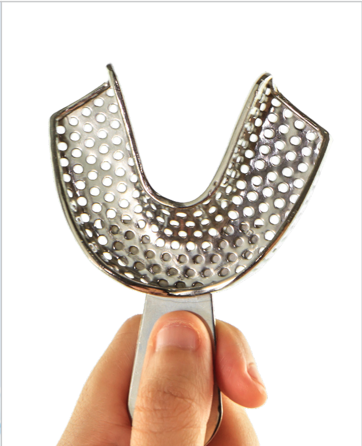
REMOVE DEBRIS & CEMENT

The ADA and CDC recommend that reusable dental instruments and impression trays be cleaned and sterilized before reuse. Optimize offers a full line of ultrasonic solutions to clean bioburden and other debris from medical instruments, to remove stains and debris from dental prosthetics like dentures and crowns, and to remove cements or impression materials from dental trays and instruments.