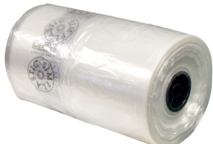
Simplastic® Barrier Protective System