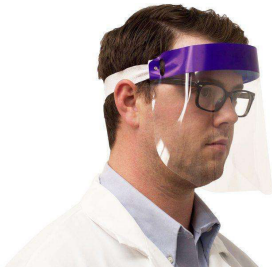
HB Anti-Fog Face Shield