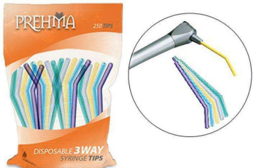
Air/Water Syringe Tips